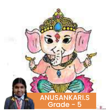
ANUSANKARI.S Grade - 5