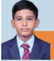
வித்யுத்.பா வகுப்பு - 6

உறவுக்கு மேலே உயிர் கொடுத்து உன்னோடு இருப்பவன் நண்பன்....!