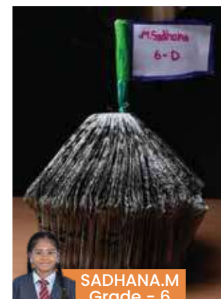
SADHANA.M Grade - 6