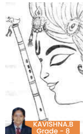
KAVISHNA.B Grade - 8