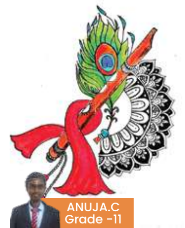
ANUJA.C Grade - 11